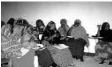
Women's Group in Training