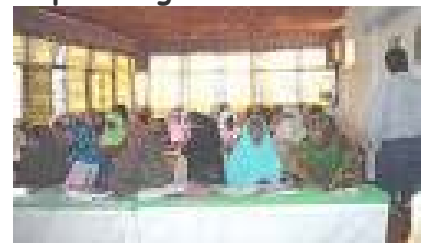
Empowering Seminars Class